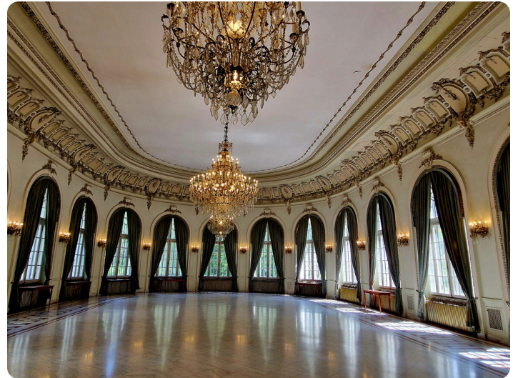
The Casino of Sinaia, National Heritage Institute, Bucharest