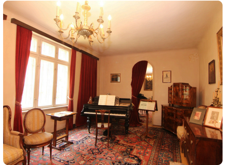
Memorial House of Sinaia

13:00 - 14:30: Lunch at the Restaurant of Vila Camelia.