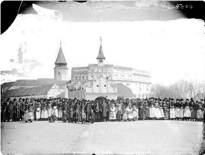
Prejmer: Landesarchiv Baden-Württemberg - Staatsarchiv Freiburg

09:00 - 13:00: Visit to Prejmer Saxon Fortified Church, a UNESCO World Heritage Monument - , and George Enescu Museum in Sinaia.